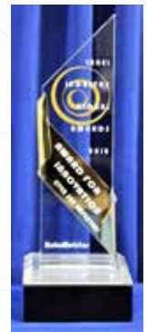
2018 Innovation Award Winner

Our RotoRepel™ Rx formulation has undergone a US Food and Drug Administration regulatory compliance review, migration testing, and toxicological safety assessment.