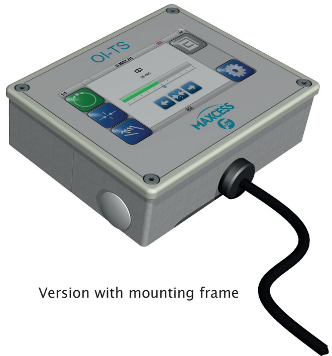
Version with mounting frame